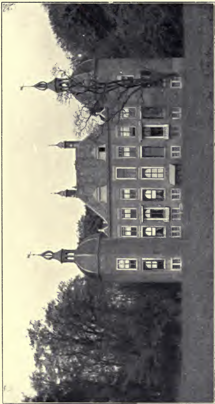
DESCARTES' HOUSE AT ENDEGEEST, NEAR LEIDEN