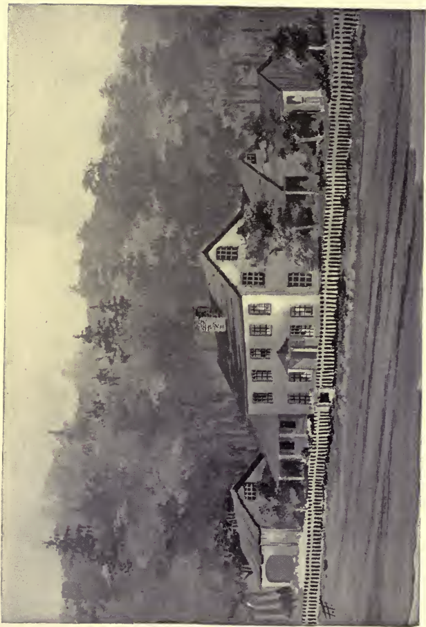
THE THEATRE OF 1848.

“Those Concord days were the happiest of my life. Plays in the barn were a favorite amusement.”