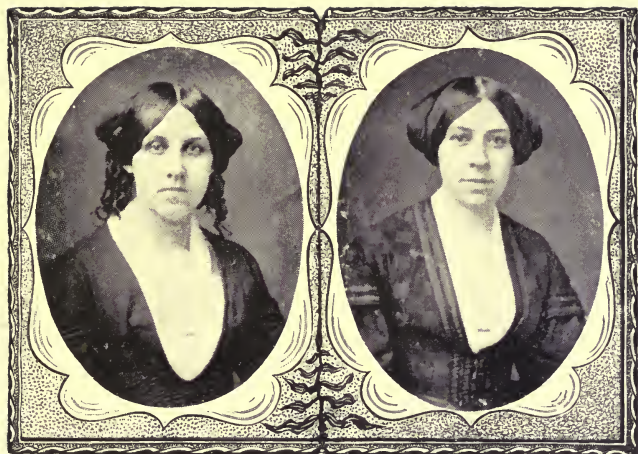
JO AND MEG.