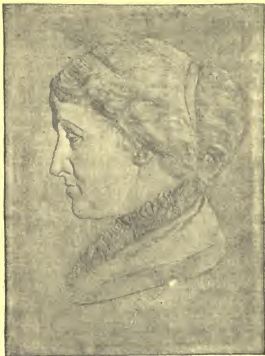
WALTON BICKETSON, SCULP.